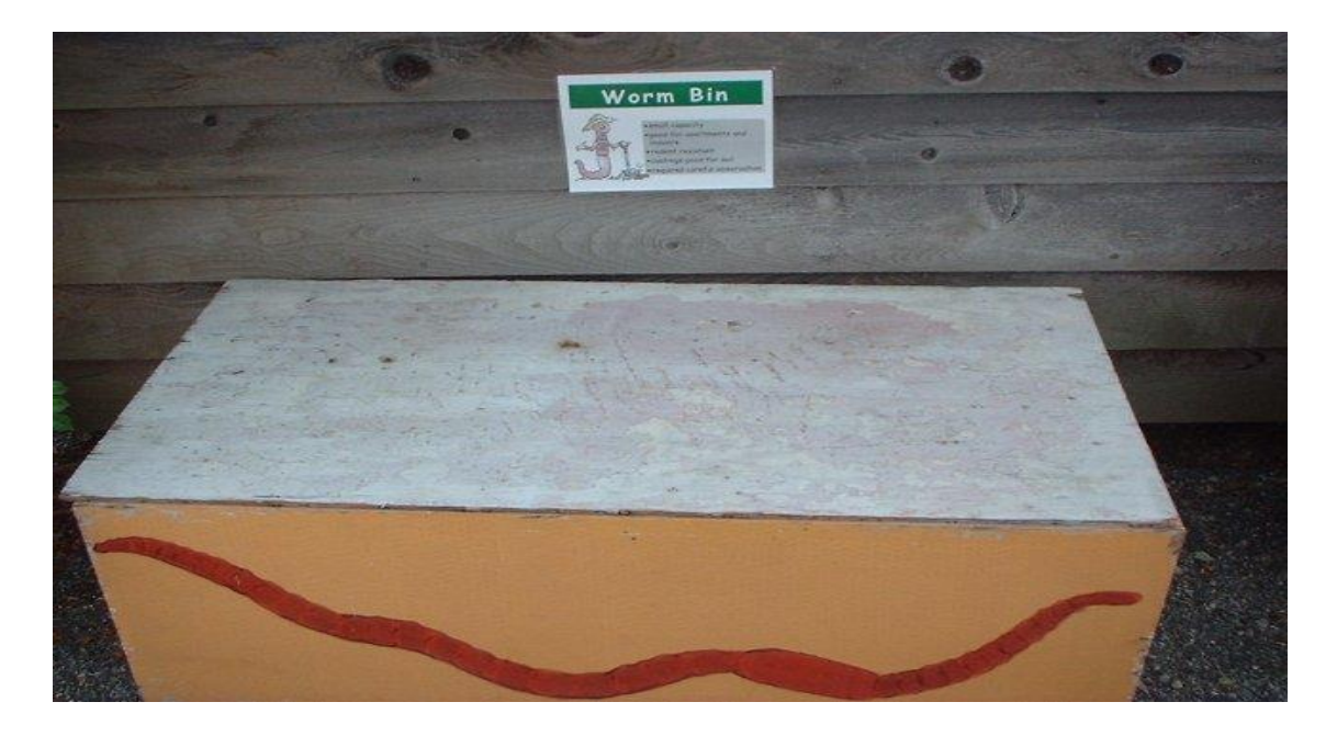
Demonstration home scale worm bin at a community garden site - painted plywood

Some materials are less desirable than others in worm bin construction. Metal containers often conduct heat too readily, are prone to rusting, and may release heavy metals into the vermicompost. Styrofoam containers may release chemicals into the organic material. Some cedars, Yellow cedar, and Redwood contain resinous oils that may harm worms, although Western Red Cedar has excellent longevity in composting conditions. Hemlock is another inexpensive and fairly rot-resistant wood species that may be used to build worm bins.